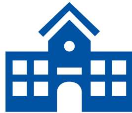
The Opening of New Charter Schools (ALN 84.282B)

Grants to Charter School Developers for the Opening of New Charter Schools and for the Replication and Expansion of High-Quality Charter Schools (Developer Grants) are intended to support charter schools that serve early childhood, elementary school, or secondary school students by providing grant funds to eligible applicants for: