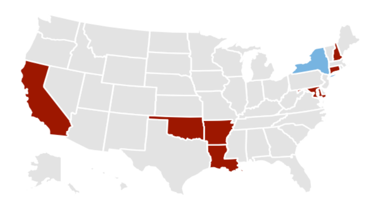
FIGURE 1: STATES EXAMINED VIA PROFICIENCY RATES ONLY

The Advisory Panel strongly encouraged NACSA to focus most heavily on student growth outcomes relative to student proficiency. There were eight states that did not have a growth model or accessible growth information despite multiple data acquisition attempts in 2015. Those eight states are included in Figure 1. For all authorizers in states without growth information, proficiency rates were examined using the same targets as authorizers with growth information.