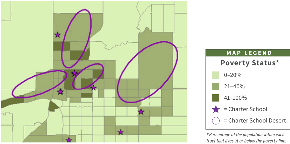
Map 3: Charter school deserts in the Tulsa metro area