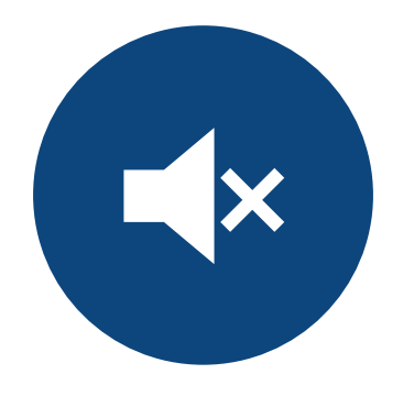
Remember to mute yourself